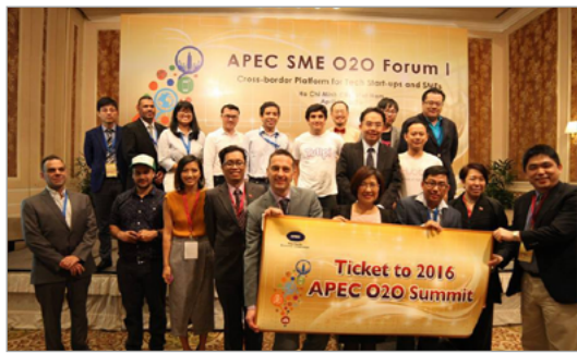
Picture 4. Triip. me, Viet Nam-based startup, are entitled to participate in the APEC O2O Summit, held in Taipei in July.